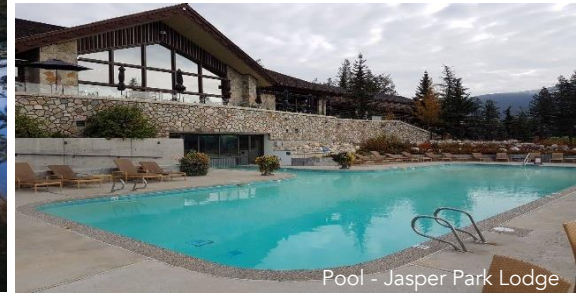
Pool - Jasper Park Lodge