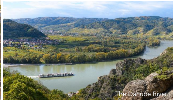
The Danube River