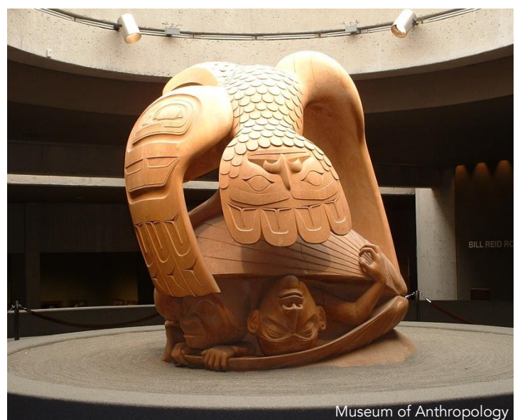
Museum of Anthropology

Redeem 50 points if you book by November 2