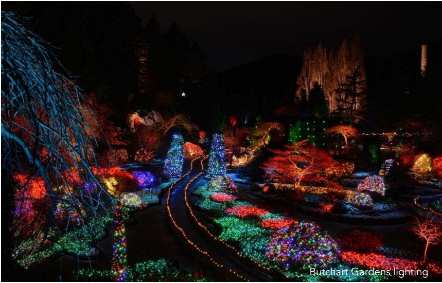
Butchart Gardens lighting