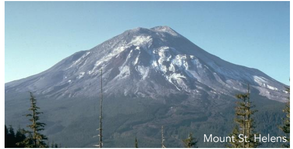
Mount St. Helens