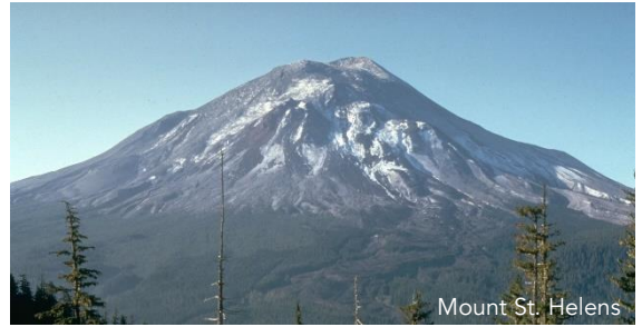
Mount St. Helens