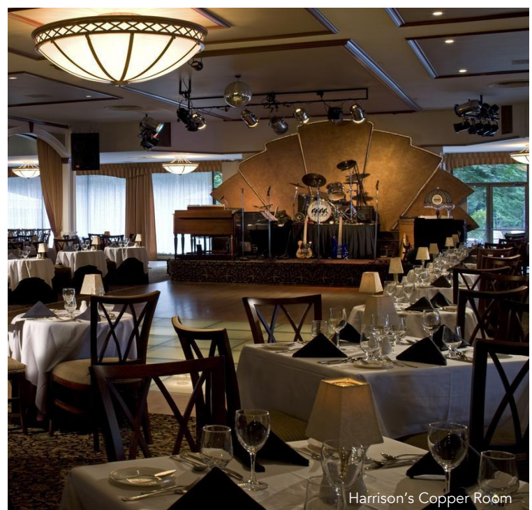
Harrison's Copper Room