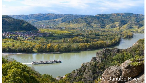
The Danube River