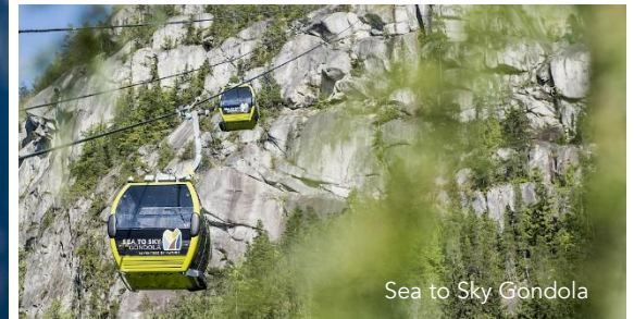
Sea to Sky Gondola