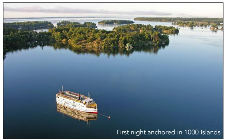
First night anchored in 1000 Islands

Redeem 93 points if you book by June 10, 2021.