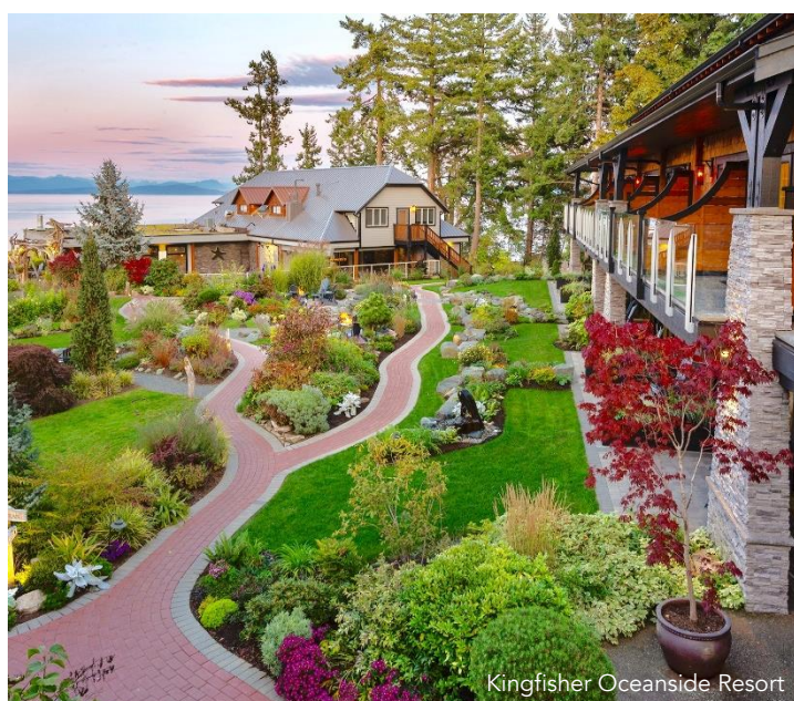
Kingfisher Oceanside Resort

Redeem 24 points if you book by August 20