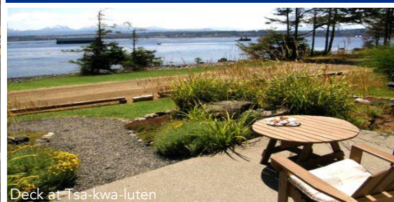
Deck at Tsa-kwa-luten