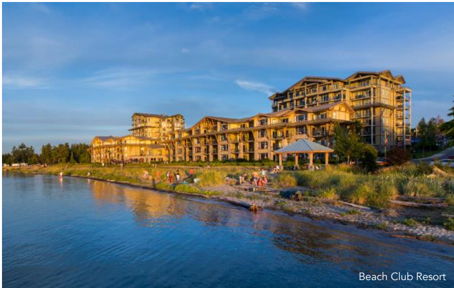
Beach Club Resort