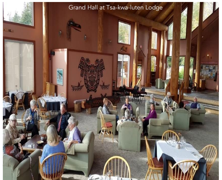
Grand Hall at Tsa-kwa-luten Lodge

Redeem 40 points if you book by April 19