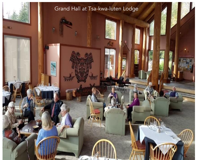
Grand Hall at Tsa-kwa-luten Lodge

Redeem 40 points if you book by April 19