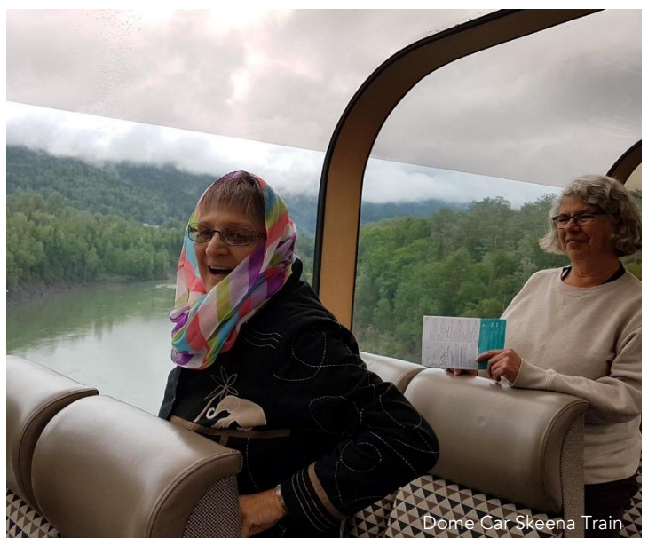
Dome Car Skeena Train