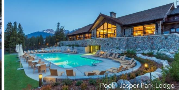
Pool - Jasper Park Lodge