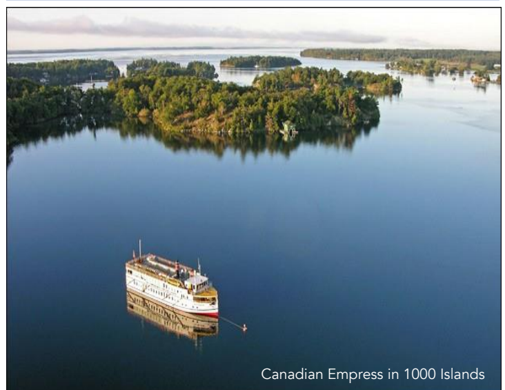
Canadian Empress in 1000 Islands

Redeem 84 points if you book by February 9, 2021.