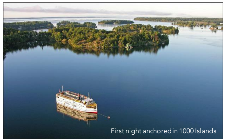
First night anchored in 1000 Islands

Redeem 93 points if you book by June 10, 2021.