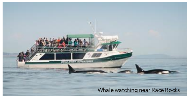
Whale watching near Race Rocks