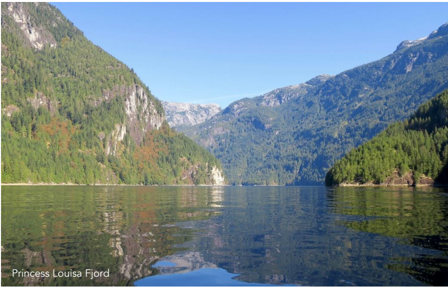
Princess Louisa Fjord