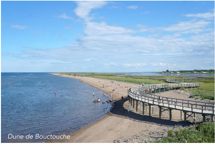
Day 3: Tuesday, July 6

Meals included: Breakfast, Lunch Accommodation: Crowne Plaza Hotel