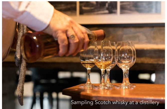
Sampling Scotch whisky at a distillery

Important Tour Information: This information letter will be provided at final payment and will include many helpful details about your tour.