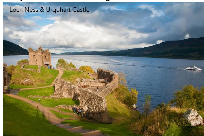
Loch Ness & Urquhart Castle

Culloden Moor was the scene of the last major battle fought in Britain, an iconic site in Scotland. The Culloden Battle of 1746 ended the Jacobite chances of restoring the exiled Stuart dynasty to the throne of Britain. Government forces led by the Duke of Cumberland crushed the army of Prince Charles Edward Stuart (Bonnie Prince Charlie) in an hour. No trip to Scotland would be complete without a cruise on legendary Loch Ness , home of the famous inhabitant Nessie. Learn all about the sightings and speculation as we watch the sonar and cruise this mysterious lake. At 37 km long, 1½ km wide, and 220 metres deep, Loch Ness contains enough water to fill every lake and river in England. The cruise travels