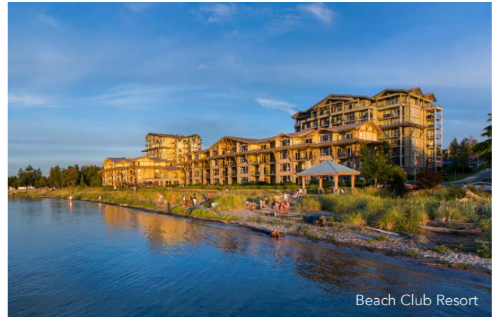
Beach Club Resort