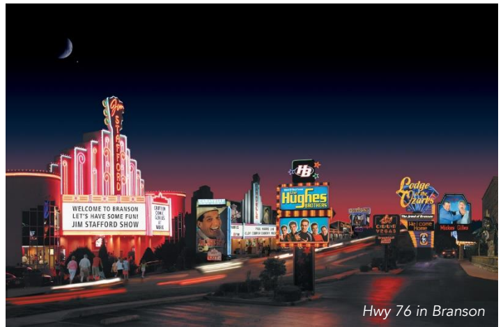
Hwy 76 in Branson

Jamboree opened the first live musical show in Branson in 1959, but the first theatre on Highway 76 was Presley's Mountain Music Jubilee in 1967. Branson began its transformation into a major tourist attraction in 1983 when the Roy Clark Celebrity Theatre opened and began to bring famous country music stars to Branson. During the next ten years, performers such as Box Car Willie, Andy Williams, Shoji Tabuchi, and Glen Campbell built their own theatres. The television series 60 Minutes aired an episode in 1991 which declared that Branson was the "music capital of the entire universe", much to Nashville's chagrin. Currently there are 40 theatres operating in Branson and it has more theatre seats than Broadway or Las Vegas. It was named the #1 U.S. destination for groups for six years and entertains more than six million visitors annually, but has a year-round population of only 11,000. Branson's title today is the "Live Music Show Capital of the World."