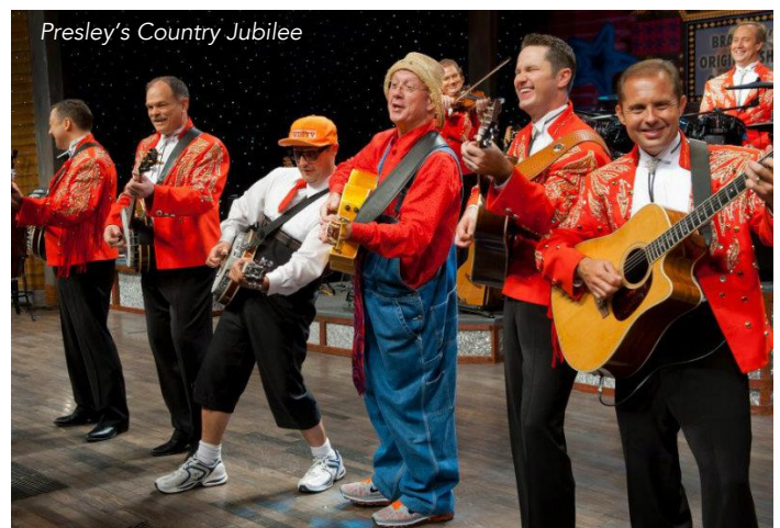
Presley's Country Jubilee