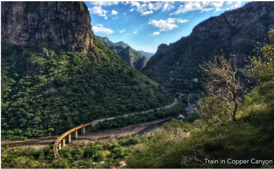
Train in Copper Canyon