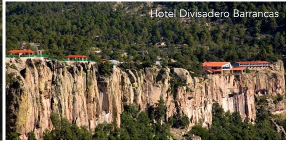
Hotel Divisadero Barrancas