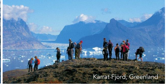
Karrat Fjord, Greenland