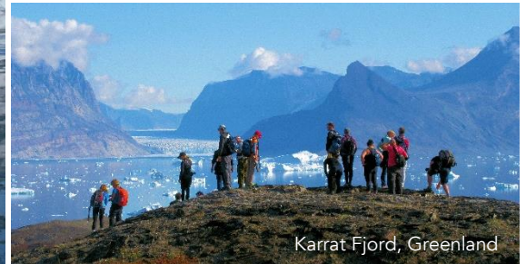
Karrat Fjord, Greenland