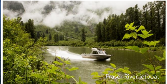
Fraser River jetboat