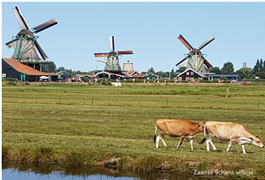
Zaanse Schans village