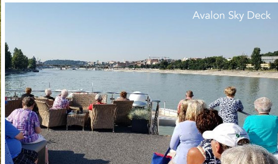
Avalon Sky Deck