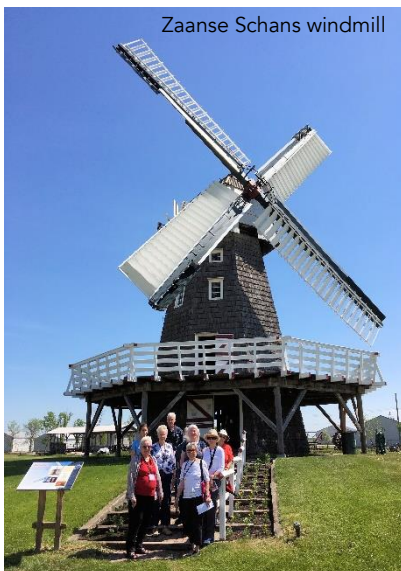
Zaanse Schans windmill

We arrive at Amsterdam's Schiphol Airport in the morning and local time is 9 hours ahead. Our Netherlands guide and driver meet us at the airport and we go to the recreated Dutch village, Zaanse Schans , dating back to 1850. Wander about the picturesque village, visit a cheese farm, paint mill, and oil mill, and view traditional crafts