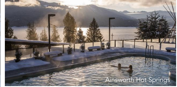
Ainsworth Hot Springs