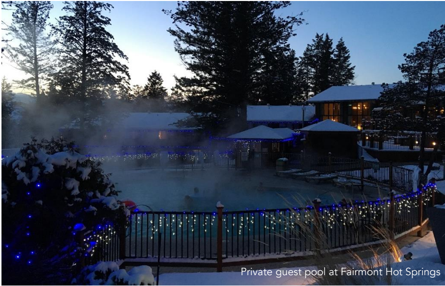
Private guest pool at Fairmont Hot Springs