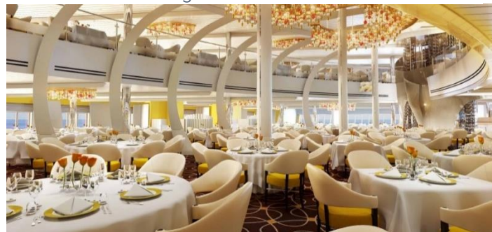
Nieuw Statendam dining room

The Nieuw Statendam carries 2,650 passengers, the largest ever built by the company. Her 12 decks feature four performance venues including the 1,000-seat live entertainment theatre, five lounges, casino, shopping arcade, movie theatre, beauty shop, library, games room, 12 elevators, internet centre, spa, fitness centre, and two swimming pools (one with sliding dome cover). The Nieuw Statendam offers 12 restaurants or cafés. The elegant two-deck Dining Room serves breakfast, lunch, and dinner with full choice of menu. The Lido Market offers buffet-style serving stations for breakfast, lunch, dinner, and the 11 pm snack. The Pinnacle Grill, Canaletto Restaurant with Italian cuisine, Tamarind Restaurant with Asian cuisine, and Sel de Mer with a seafood menu all offer extraordinary service, reserved seating, and gourmet menus for an extra charge. You can also dine in the privacy of your stateroom by ordering from the complimentary room service menu. All meals are culinary delights!