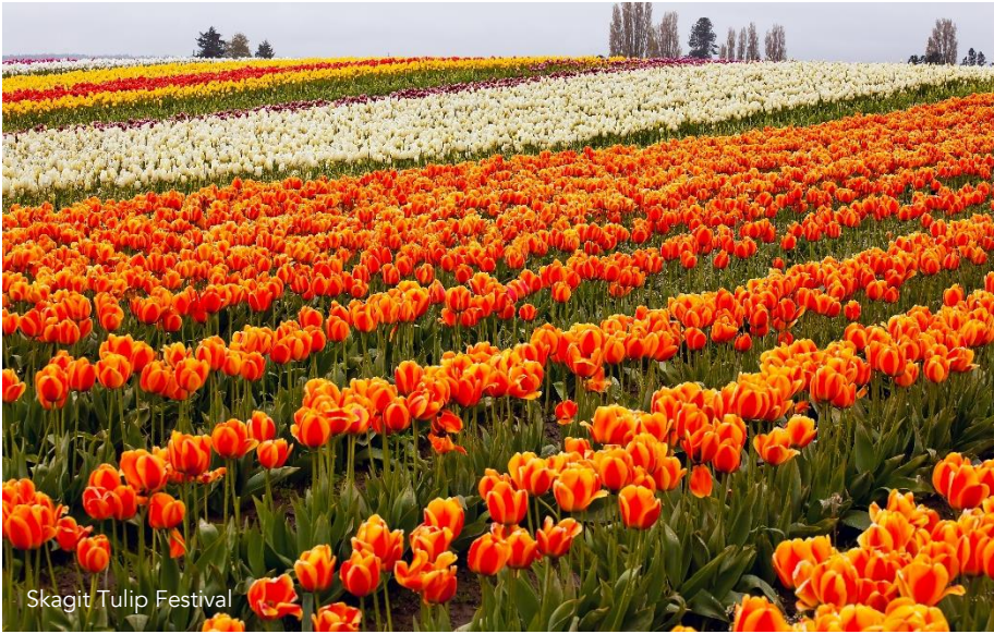
Skagit Tulip Festival