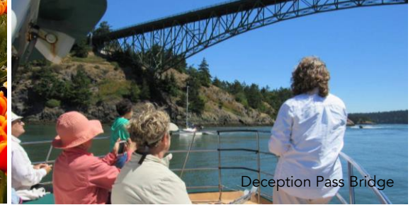
Deception Pass Bridge