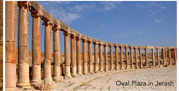
Oval Plaza in Jerash