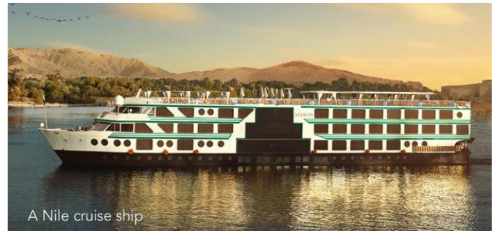
A Nile cruise ship