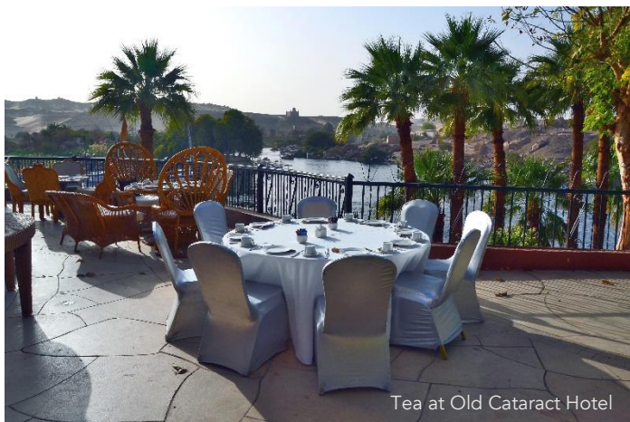
Tea at Old Cataract Hotel