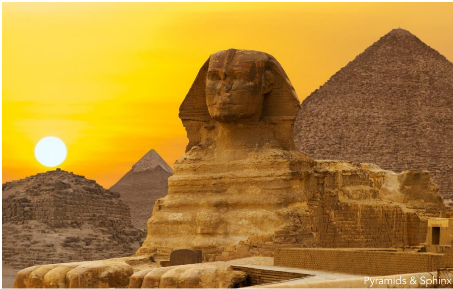
Pyramids & Sphinx