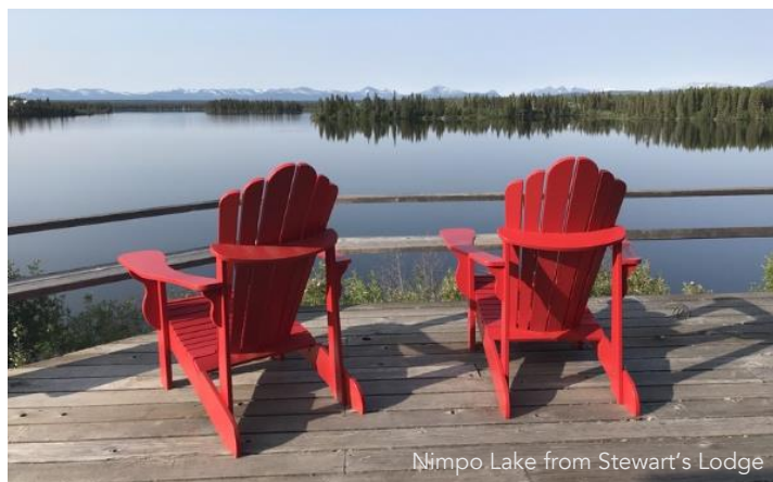
Nimpo Lake from Stewart's Lodge