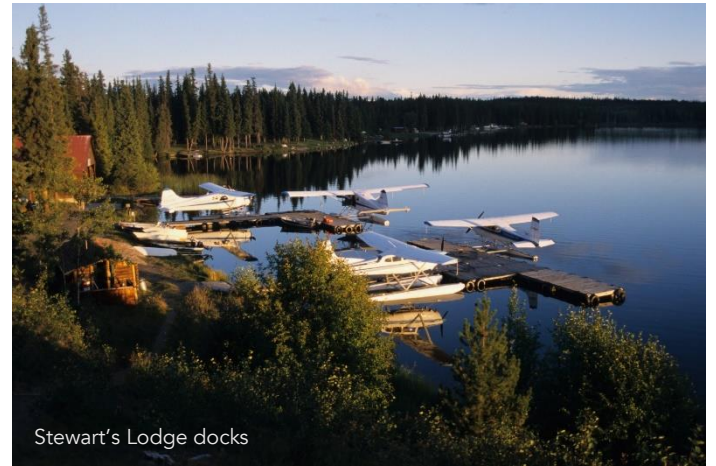
Stewart's Lodge docks

Accommodation: Stewart's Lodge or Waterfront Motel