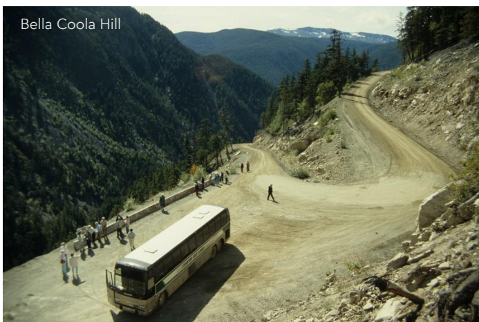
Bella Coola Hill