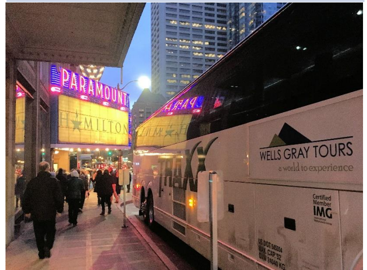
Hamilton at Paramount Theatre Seattle in 2018