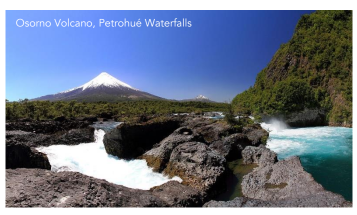
Day 26: Thursday, February 23