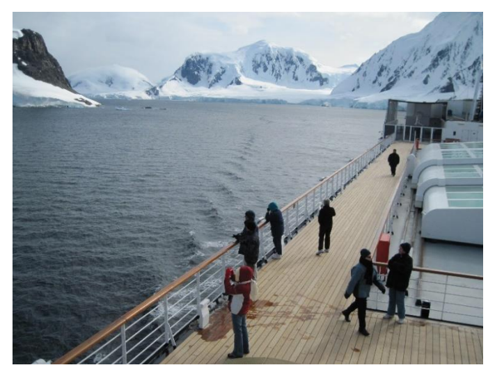
Day 18: Wednesday, February 15 Cruising north across Drake Passage. Meals included: Breakfast, Lunch, Dinner Accommodation: Oosterdam

Meals included each day: Breakfast, Lunch, Dinner Accommodation: Oosterdam