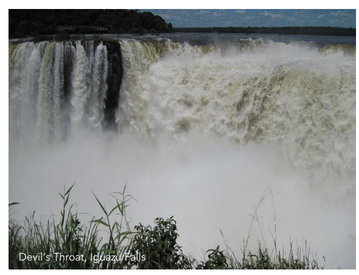
Day 5: Thursday, February 2

Meals included: Breakfast, Lunch, Dinner Accommodation: Sheraton Hotel Iguazu Falls