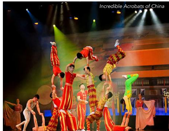
Incredible Acrobats of China