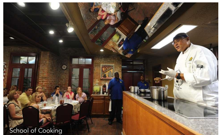
School of Cooking