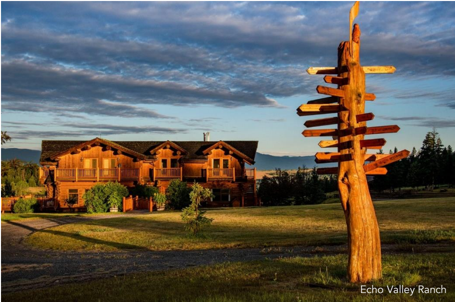
Echo Valley Ranch