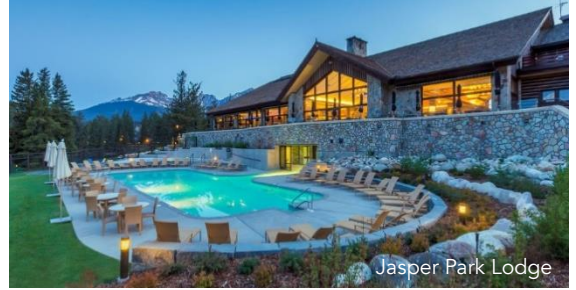
Jasper Park Lodge