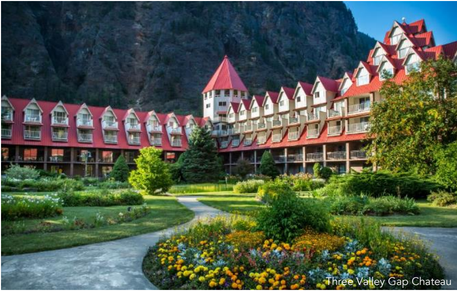
Three Valley Gap Chateau