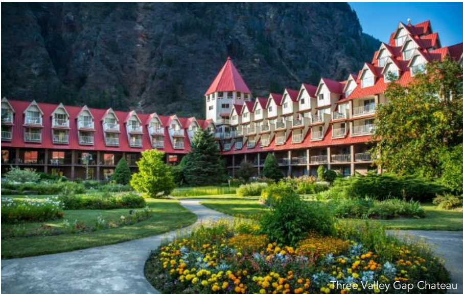
Three Valley Gap Chateau