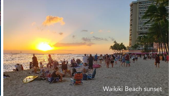
Waikiki Beach sunset