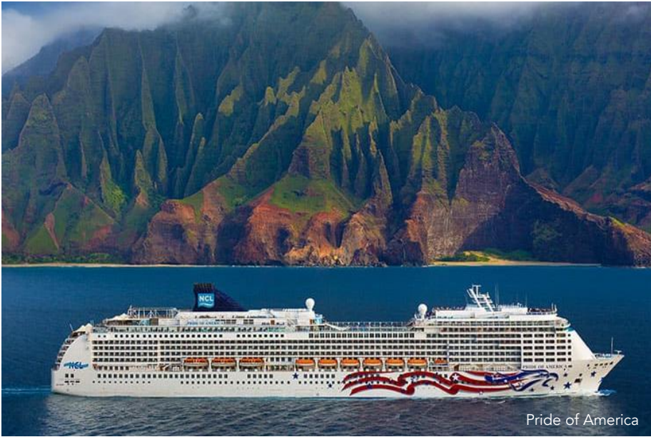
Pride of America