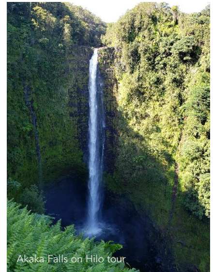
Akaka Falls on Hilo tour