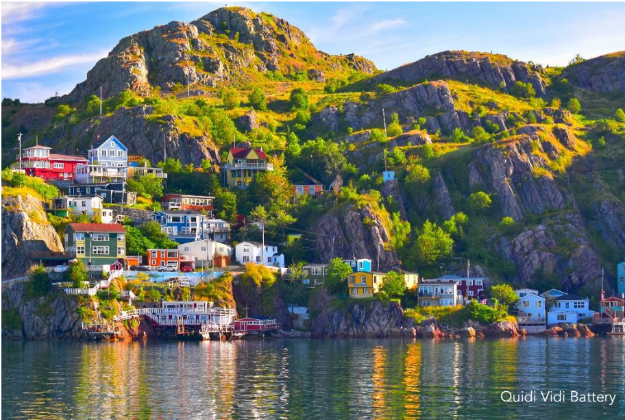
Quidi Vidi Battery