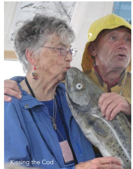
Kissing the Cod