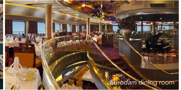
Eurodam dining room