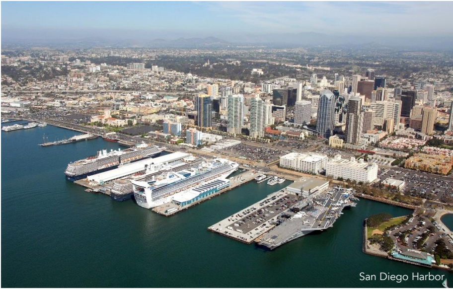
San Diego Harbor