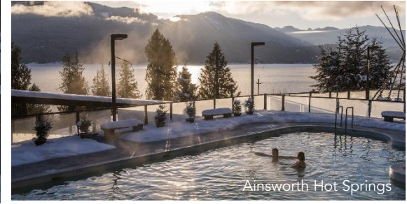
Ainsworth Hot Springs