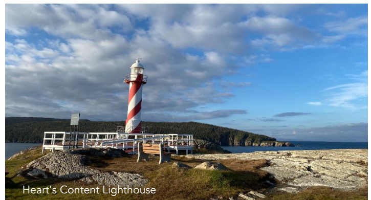
Heart's Content Lighthouse