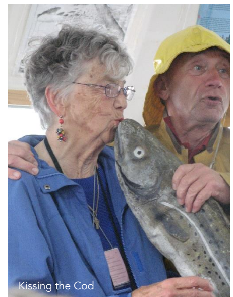
Kissing the Cod