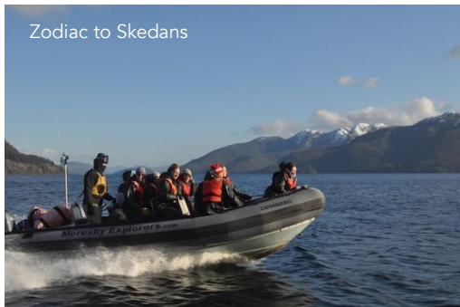
Zodiac to Skedans

Activity Level 3: Tour includes walking over uneven surfaces, some steep terrain, stairs, sandy or pebbly beaches, and boardwalks that may be slippery. The optional hike up Tow Hill is strenuous. The Zodiac trip to Skedans may experience rough water, but most of the route is through sheltered waterways. Getting in and out of the Zodiac may be challenging for some. Seeing everything requires active participation. The tour director and driver have many responsibilities, so please do not expect them, or your fellow travellers, to provide ongoing assistance. Prior to Wells Gray accepting your booking, you will be required to sign a declaration that you are capable of travelling on an Activity Level 3 tour. If you are not able to keep up with the group or require frequent assistance, the tour director may stop you from participating in some activities or some days of the tour. In extreme situations, you may be required to leave the tour and travel home at your own expense; travel insurance will probably not cover you.