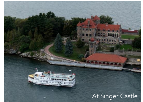
At Singer Castle

Wells Gray Tours has offered seven cruises on the Canadian Empress since 2016 with excellent reviews. Come and experience a different kind of river cruising on an intimate ship.